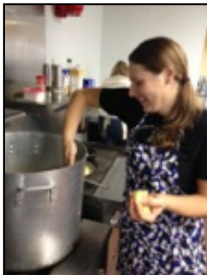
Cooking at Thanksgiving