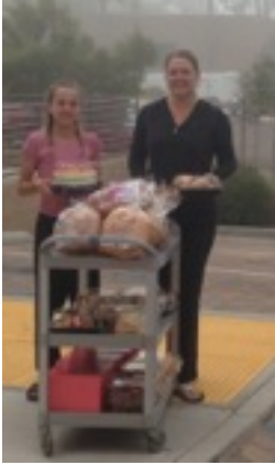
Bread pickup volunteers

Volunteers are essential to La Posada's mission, helping to shelter homeless men and to find them jobs and housing and to support farmworkers who plant the crops in and around Carlsbad. La Posada has a small dedicated staff to meet these needs, but they rely on volunteers to take care of the other tasks that keep La Posada running well.